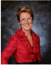
Ann Worth Chair